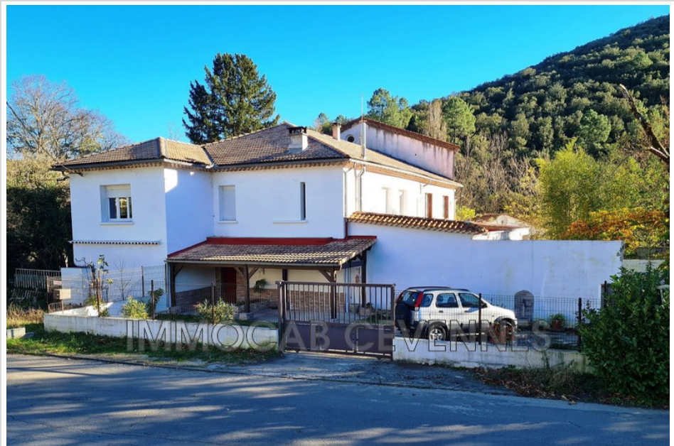
House 76 Alès

CEVENNES BASSES. 19th century stone house, renovated in 2022, on a plot of 640m 2 . This property offers 176m 2 of living space. Composed on the ground floor: Kitchen open to living room with a fireplace, 1 master suite (bathroom, toilet, dressing room). On the 1st floor 3 bedrooms with bathroom, toilet, individual dressing room. Large shaded terrace. Quiet environment, joint ownership not overlooked.